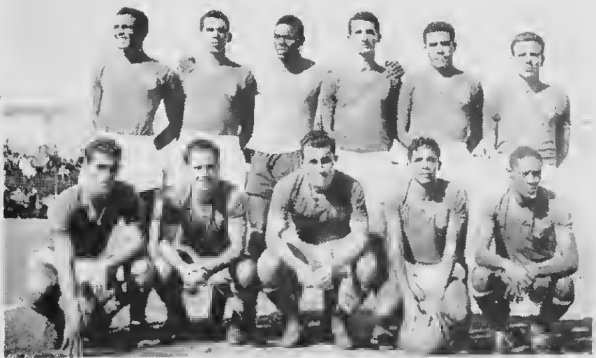
BRAZIL'S professional football club - the Bon Succeso - will engage the AVB squad at Wilhelmina Stadium May 8.